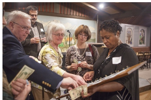
Side Board action