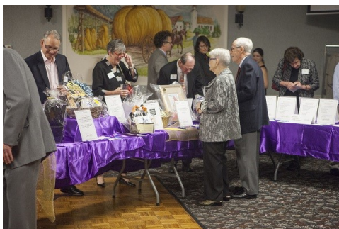
Attendees look over the silent auction items